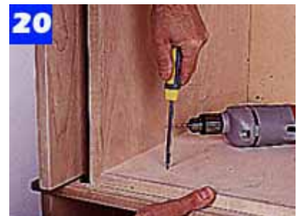
After assembling the case insert, bore pilot holes and fasten it to the cabinet top and middle shelf with screws.

Cut 1/2-in. maple to size for the drawer parts. Use a dado blade to make the rabbet and dado joints in the drawer sides and the grooves for drawer bottoms. Assemble the drawer boxes with glue and 4d finishing nails.