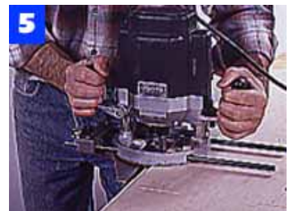
Use a straight bit and edge guide to rout the rabbets along the back edges of the case sides and the top and bottom panels.

Use a router with a straight bit and edge guide to cut the rabbets along the back edges of the case sides ( Photo 5 ). Note that the rabbets for the top and bottom panels stop short of the panel ends. Use a sharp chisel to square the rabbet ends after they've been routed.