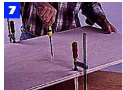
Because screwheads will be hidden, use plates to align the parts and use screws to join the partition to the case's middle shelf. Plates keep parts aligned.