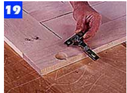
Bore 35mm-dia. recesses in the door stiles for the hinge cups. Then, install the hinges to the doors and adjust for proper operation.

Use a Forstner or multispur bit in a drill press to bore a 35mm-dia. x 1/2-in.-deep recess in the doors for each hinge. Install the hinges (Photo 19) and mount the doors on the slides. Use the mounting-plate screws to adjust the doors for proper operation and a uniform 1/8-in. margin.