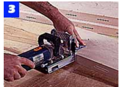
Glue up solid maple stock to form the case top. Joining plates in mating surfaces help keep pieces aligned during assembly.

Make the 24 3/4-in.-wide maple top by gluing up several narrow pieces of stock. Cut each piece an inch or two longer than finished dimension and joint the mating edges. While simple glued butt joints are fine, joining plates help align the pieces during assembly. After cutting the slots ( Photo 3 ), spread glue, install the plates and clamp the boards. Scrape off excess glue after about 20 minutes. When the glue has fully cured, use a circular saw and straightedge guide to cut the panel to size.