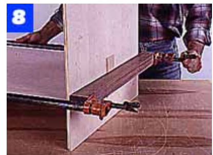
Glue the case sides to the middle shelf. A caul with a thin veneer shim at the center distributes pressure across the panel.