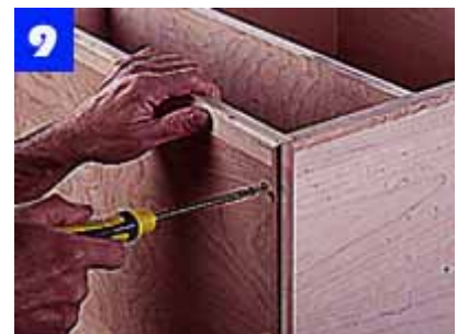
Use a combination of joining plates and screws to fasten the case bottom to the