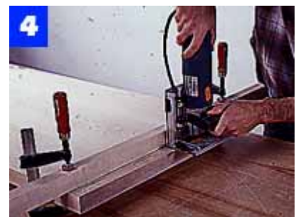
Cut joining-plate slots in case parts. Clamp a guide across the panels to help position the joiner for slots in the panel faces.

Lay out the joining plate positions for the case panels and cut the slots. For slots in a panel face, use a straightedge guide to position the plate joiner ( Photo 4 ).