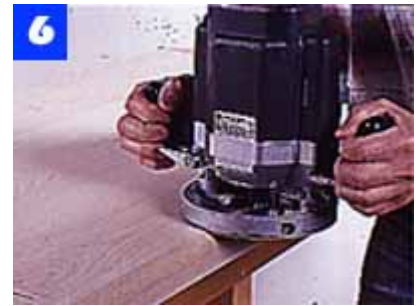
Use a 5/8-in.-rad. rounding-over bit to shape the bottom edge of the case top. Rout a 30-degree chamfer around the edge.

Bore and countersink screwholes in the case bottom, and pilot holes in the case sides and drawer partition. Then, install joining plates and screw together the parts ( Photo 9 ).