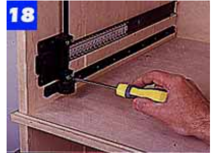
Screw the pinion-wheel/mounting-block assembly to the door slide. Detailed instructions are included with the hardware.

Study the instructions included with the door hardware so that you understand the operation of the slide before beginning the installation. Secure the door slides to the inside of the cabinet sides. Cut small spacer blocks to help position the slides accurately from the case top and bottom and parallel to each other. Next, attach the rack drives to the case sides. Secure the pinion wheels and mounting hardware to the profile rods as shown in the slide instructions. Mount the rod assembly on the slides (Photo 18) and fasten the mounting plates.